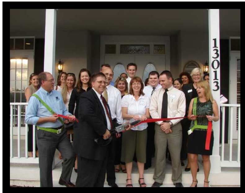
Dave Schmitt Engineering, Inc.'s Ribbon Cutting Ceremony

Dave Schmitt Engineering, Inc. was elated to have it's officially ribbon cutting ceremony and an open house immediately following on March 1 st , 2007. The event was a memorable occasion for the staff of Dave Schmitt Engineering and was enjoyed by all who attended. We would like to give a special thank you to the East Orlando Chamber for their involvement with this event.