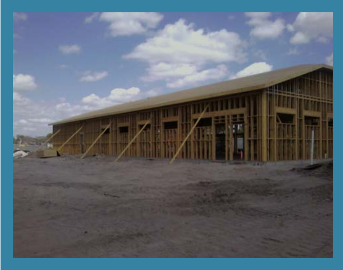
Ocoee Post Office Carrier Annex

Location: Ocoee-Apopka Road, Ocoee, FL Developer: United States Postal Service Architect: Archinetics Grand Opening Expected: Summer 2009