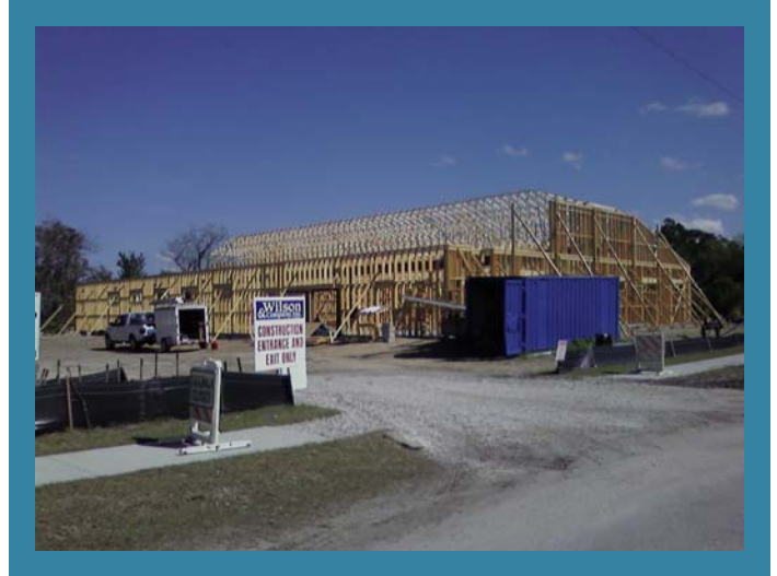
Oviedo Post Office Carrier Annex

Location: East Franklin Street, Oviedo, FL Developer: United States Postal Service Architect: Archinetics Grand Opening Expected: Summer 2009